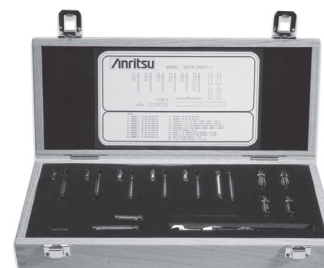
3657 Series V Cal Kit