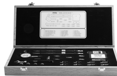
3654D Series Cal Kit