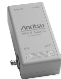
36585V Series AutoCal Module