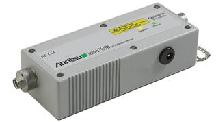
O/E Calibration Module MN4765B