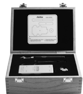
36585 Series Cal Kit