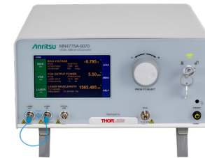
E/O Converter MN4775A